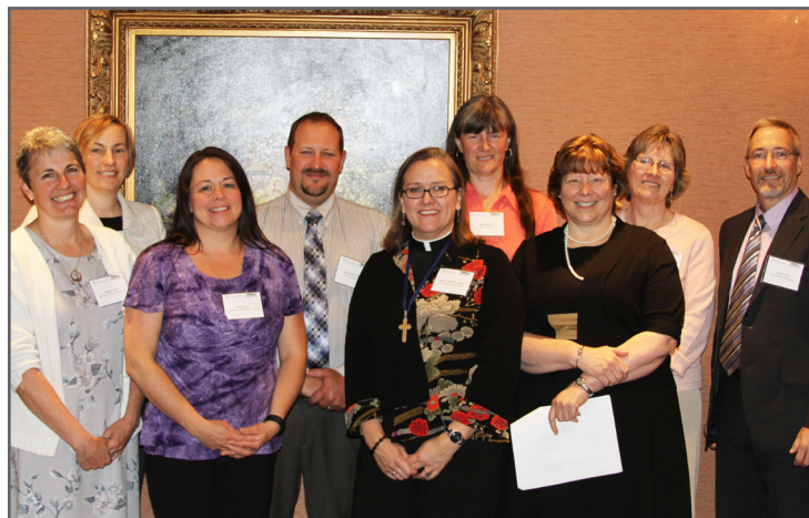
Members of the 2015 NHHPCO Board of Directors